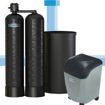
KineticoPRO™ POU Water Softeners