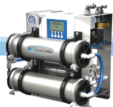
KineticoPRO™ RO Systems