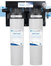
KineticoPRO™ Water Filtration

34% of patrons rate ice quality as "extremely important"