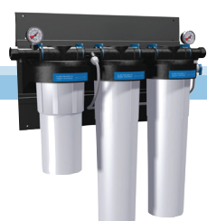
KineticoPRO™ Water Filtration