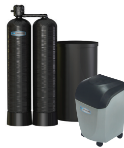
POE & POU Water Softeners

KineticoPRO offers a complete range of commercial water treatment solutions. Based on a per-location water analysis, we will work with you to prescribe the ideal water filtration, softening, and reverse osmosis solutions to optimize your water quality and protect your equipment.