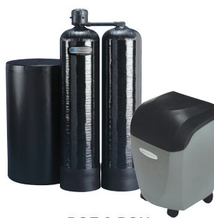
POE & POU Water Softeners

KineticPRO® offers a complete range of commercial water treatment solutions. Based on a per-location water analysis, we will work with you to prescribe the ideal water filtration, softening, and reverse osmosis solutions to optimize your water quality and protect your equipment.