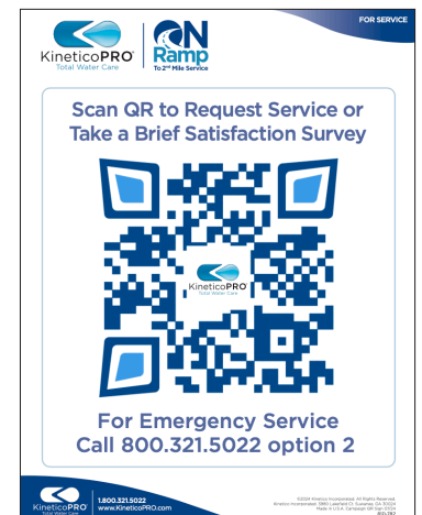
Wall QR Poster